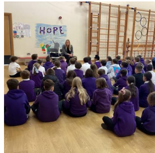
Getting quizzed at Cwmbach Community School