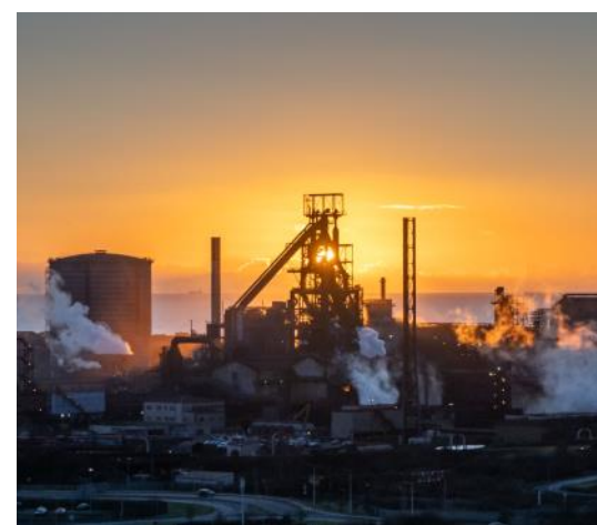
TATA Steelworks at Port Talbot