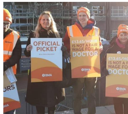
With Junior Doctors at Prince Charles Hospital