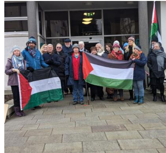
With local people at the recent Gaza for vigil in Aberdare

Finally, we have been extremely busy with casework over the winter so far, the busiest it has been in my time as an MP. We have seen ever increasing number of constituents in energy debt, and unfortunately are issuing food and fuel bank vouchers at a faster rate than ever before. We really need to get the Tories out.