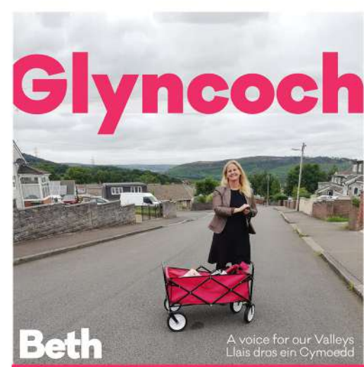
Out and about with my trolley in Glyncoch

A voice for our valleys Llais dros ein Cymoedd