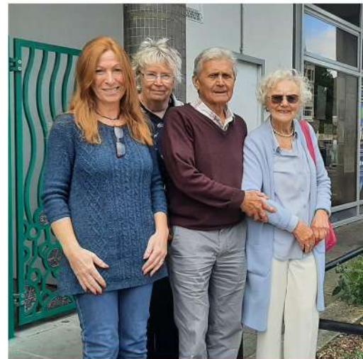
Members of Cynon Valley CND marking Hiroshima Day