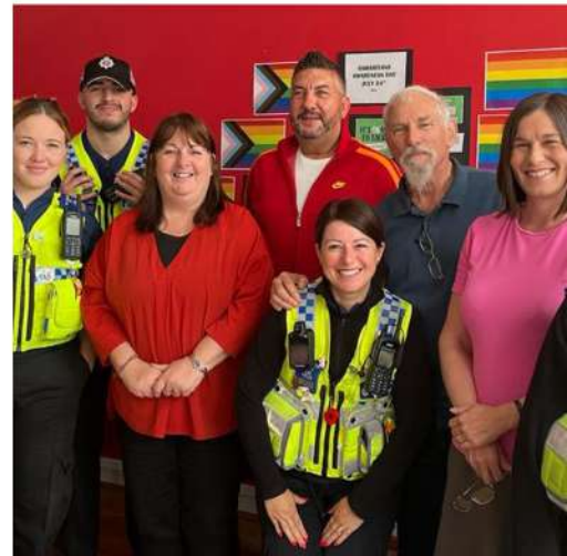
Cuppa with a copper in my Aberdare office

In August, GCSE and A-level students receive their results. Huge congratulations to all learners on their hard work. I hope you all got what you were hoping for, but it's important to remember that your exam results don't determine who you are and what you can be. There will always be other exciting options.