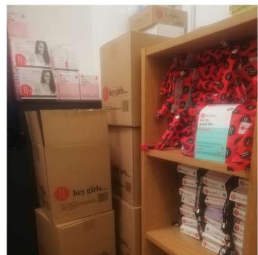
Free 'Hey Girls!' period products in my office