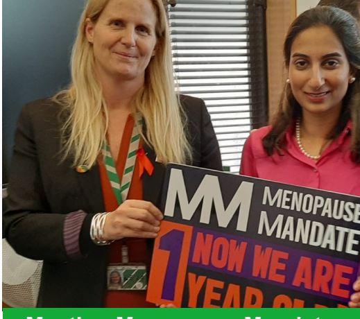
Meeting Menopause Mandate in Westminster