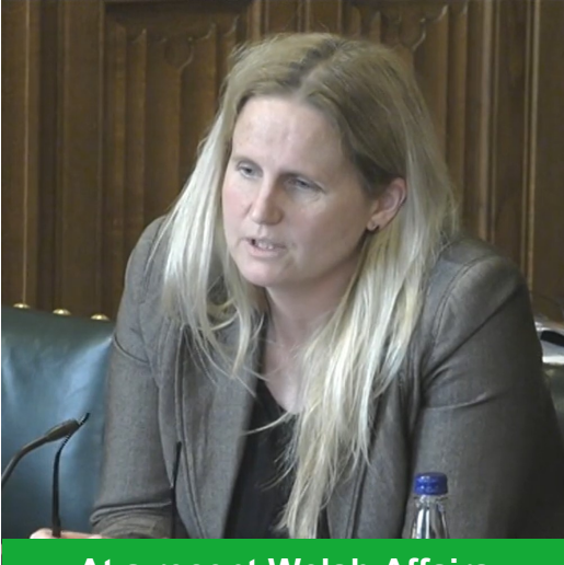
At a recent Welsh Affairs session on Water Quality