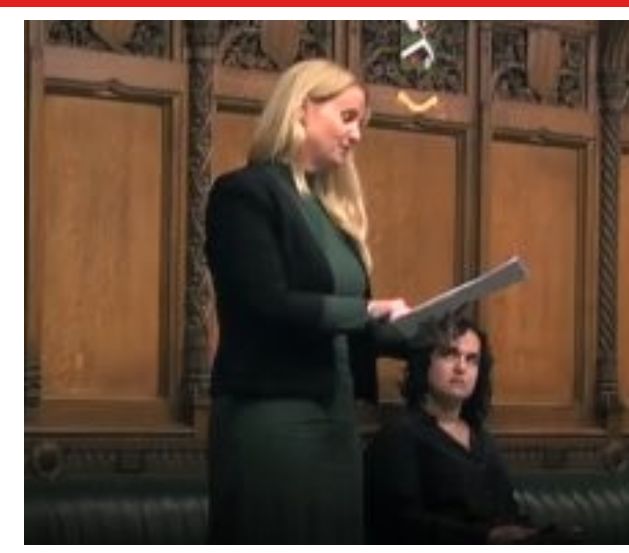
Giving a speech in the House of Commons