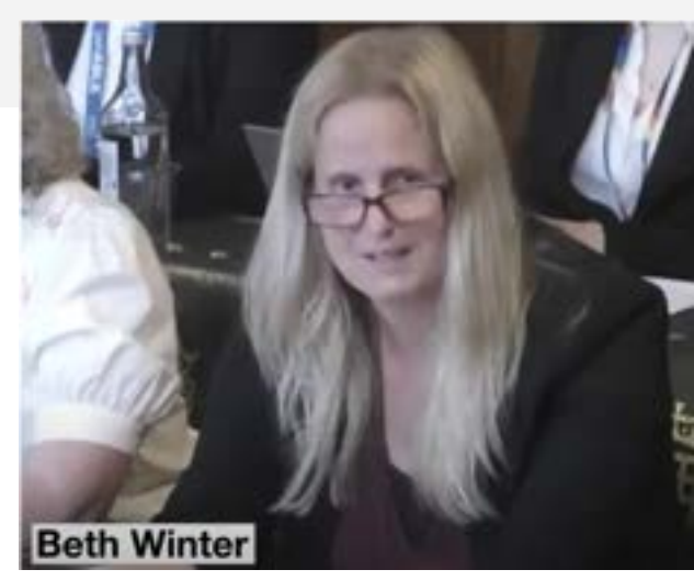
From Novara Media's coverage of Lord Geidt's resignation