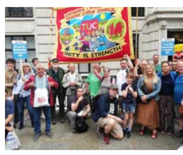
Cynon comrades & the amazing Trades Council banner in London.