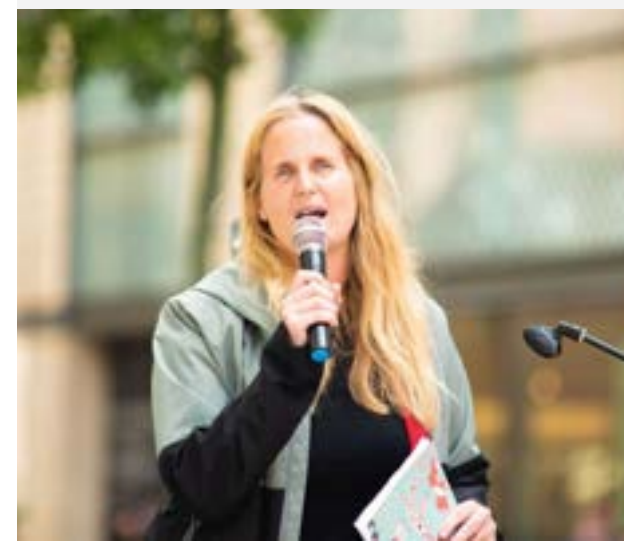
Giving a speech at a demo calling for fair pay.