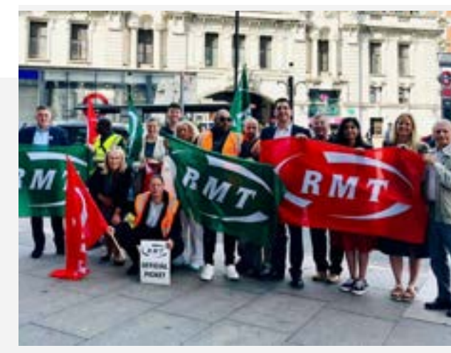
Supporting the RMT strike with fellow Labour MPs (and my dad)