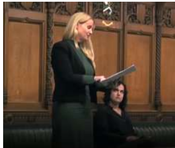
Speaking against the Policing Bill in Parliament

Finally, the campaign for a UBI continues and I had the privilege to speak at a couple of UBI Lab Network events this month.