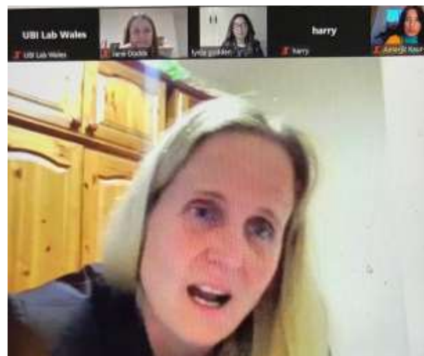
Speaking at a recent UBI Lab Network Event