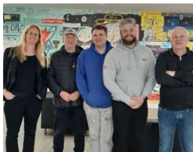
At the amazing Hirwaun YMCA with the Men's Shed & YMCA staff