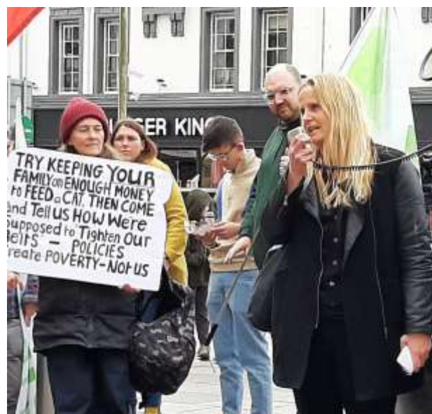
Speaking at the cost of living demonstration in Cardiff

Finally, I was delighted to be invited to speak at the first ever Cardiff Transformed this month. Hopefully the first of many!