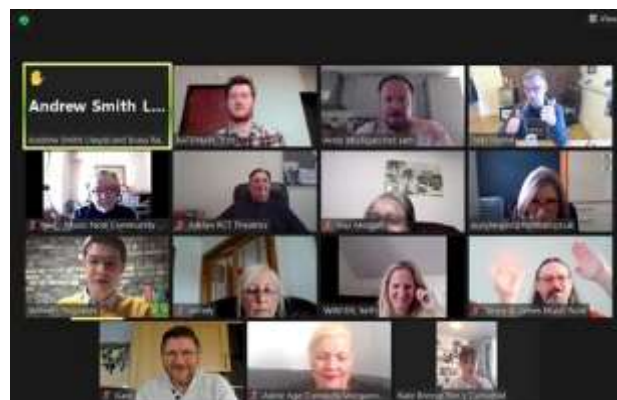
A zoom call with arts and culture groups in Cynon Valley!